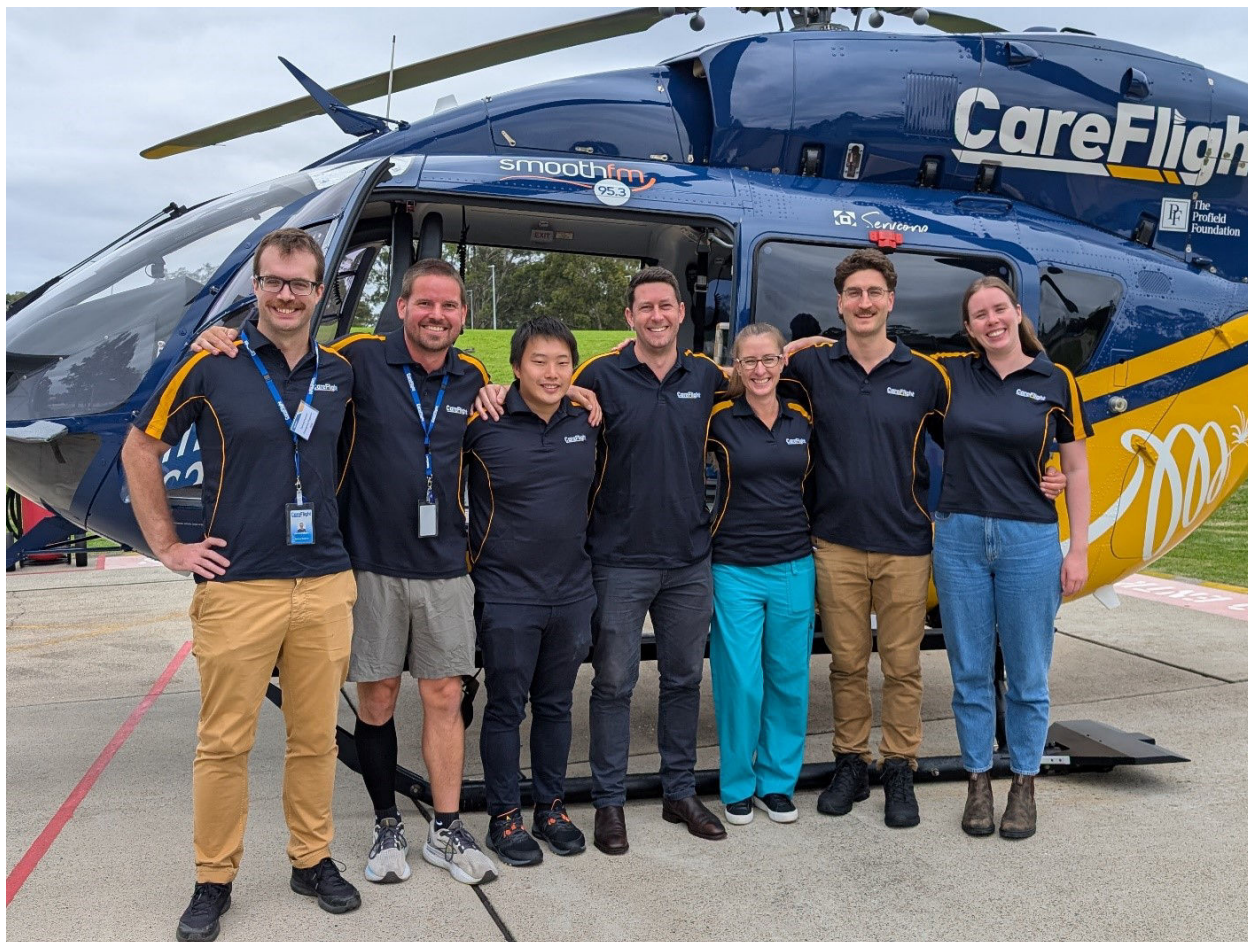
February 2025 CareFlight Registrars